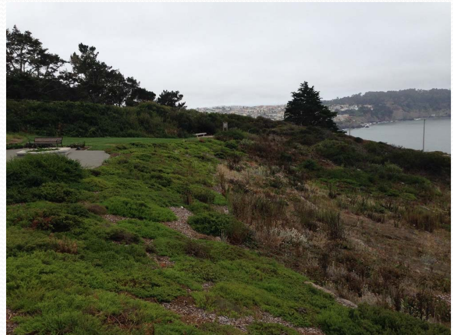
World War II Memorial plants 2014 and 2015