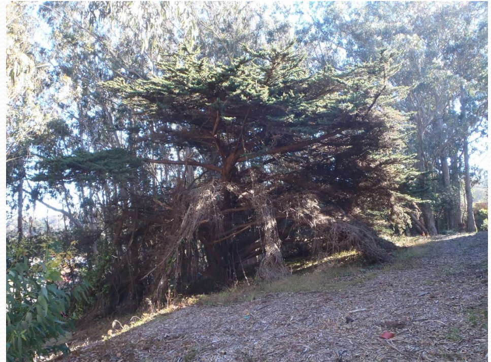
Tree 80 – Spreading, broken branches