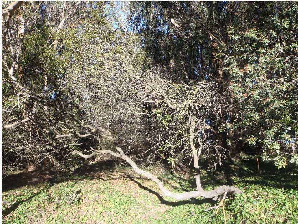
Tree 58 - Dead