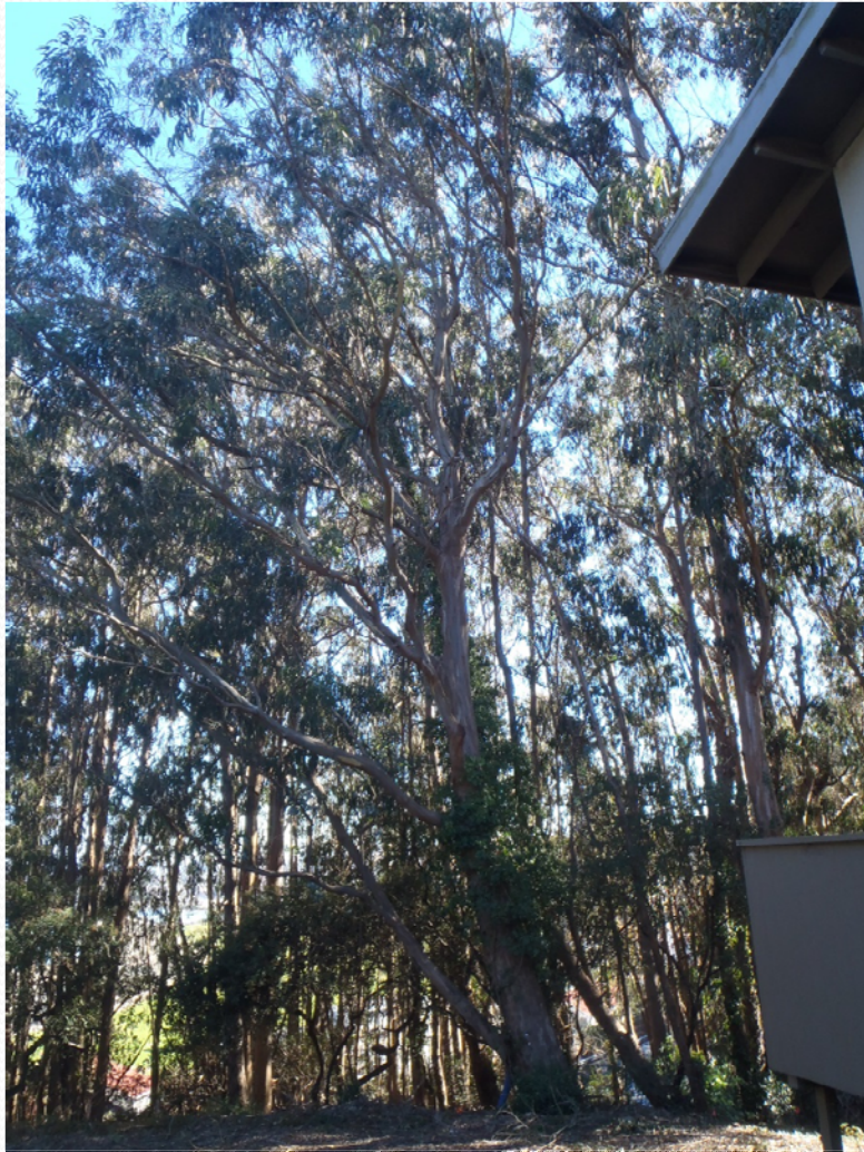
Tree 50 – Windswept, dieback, will preserve