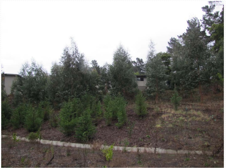
Trees planted at Landfill E (Pop Hicks Field) in 2013 and today