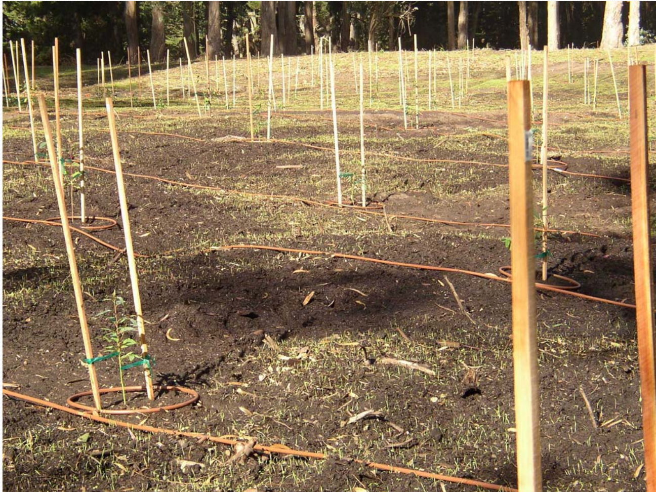
Eucalyptus trees planted in 2003