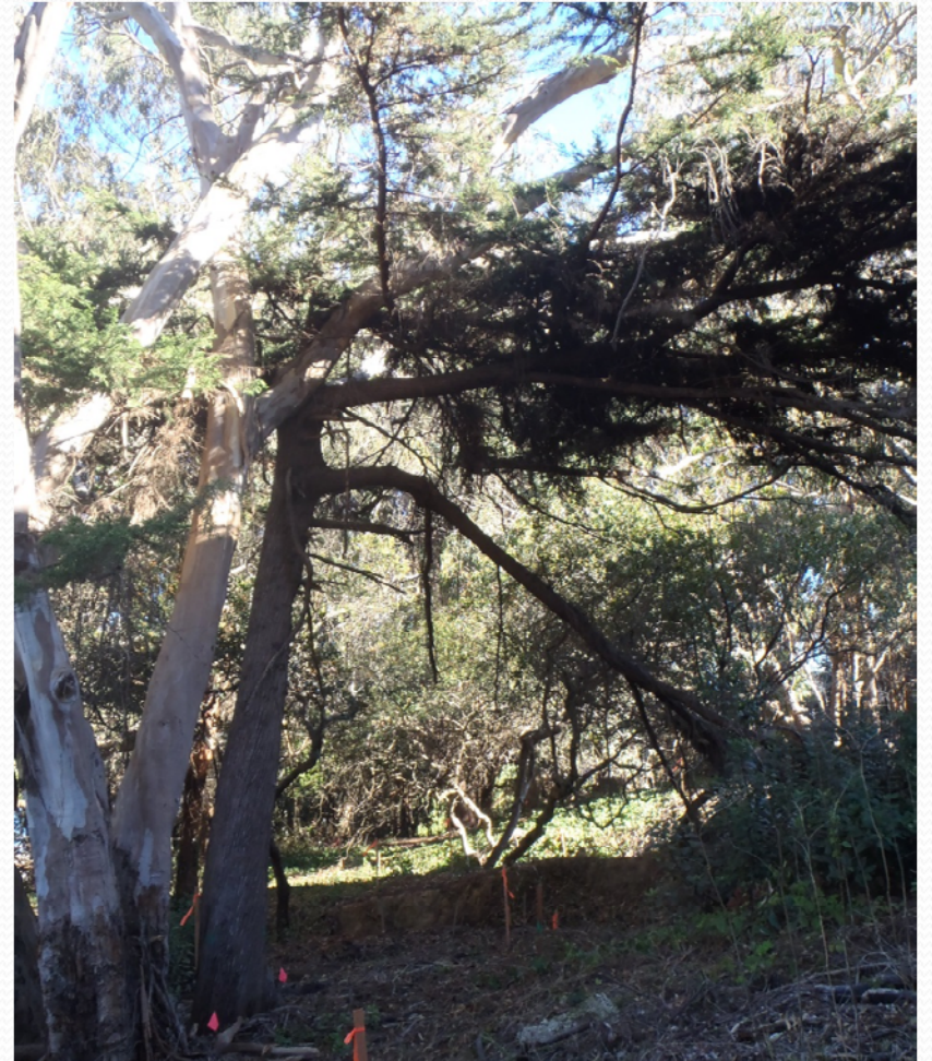
Tree 130 - Poor form and structure